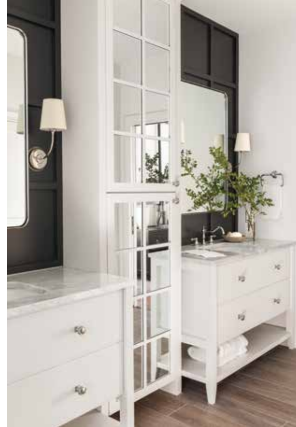
HIS & HERS: Two vanities in the newly created en-suite bath for the primary bedroom continue the home's black-and-white theme. Vendome sconces with white shades peek out from the black paneled walls and honed Carrara marble countertops on custom designed vanities are topped by nickel faucets from Water Street Brass.

TEXTURE, PRINTS, PATTERNS: Upstairs, Kristin played with fabrics and patterns in the two guest bedrooms. (Above) A Phillip Jeffries textured wallpaper reflects the beauty of the maritime forest just outside the windows, and a bold blue screen print by English artist Emma Lawrenson, commissioned by Kristin, adds another organic element. In the second guest room (left), the designer added panel modeling around a patterned wallpaper as a second headboard. The light gray of the paper is continued in the bedding and nightstand, which is topped by the Visual Comfort "Hudson Swing Arm" wall sconce in polished nickel from Circa Lighting.