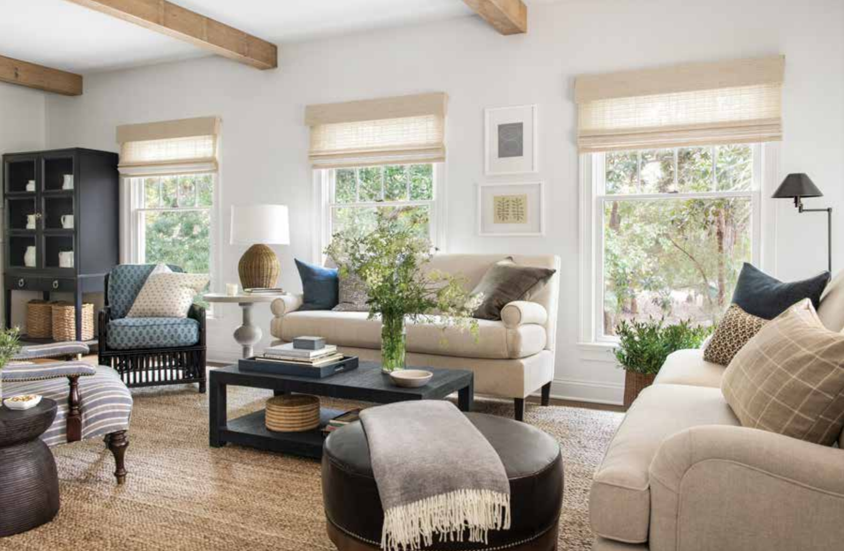
ON THE BRIGHT SIDE: Originally hidden behind a central structural wall, the light, bright sitting room welcomes visitors into the home and provides a clear contrast from the den (left). There, the couple added a wall to create a cozy space for watching television and enhanced it with a dramatic Phillip Jeffries silk raffia wallpaper in "Obsidian," custom leather coffee table, and another large photograph by artist Ben Ham.